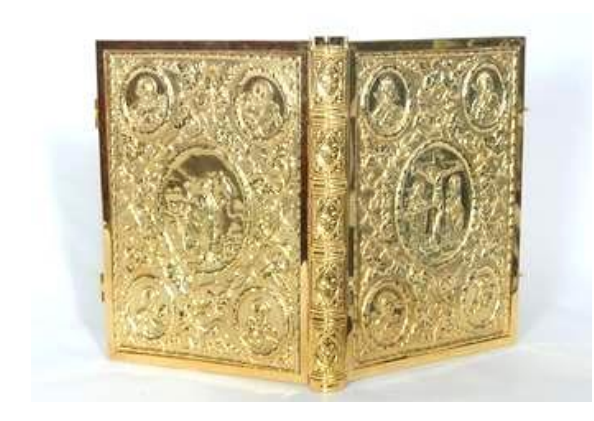
The Gospel According to Matthew 19: 16 - 26

having shod your feet with the equipment of the gospel of peace; besides all these, taking the shield of faith, with which you can quench all the flaming darts of the evil one. And take the helmet of salvation, and the sword of the Spirit, which is the word of God.